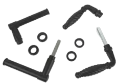
Handles (one set depending on your choice)