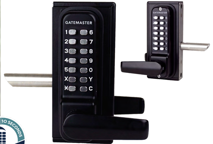
BDGRR right hand version shown