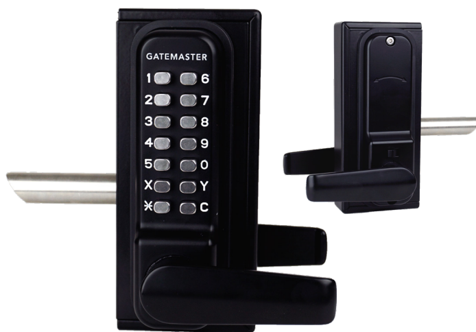
BDGSRR right hand version shown