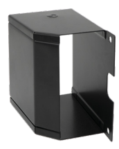
Superlock Quick-Exit Shroud (BQS)